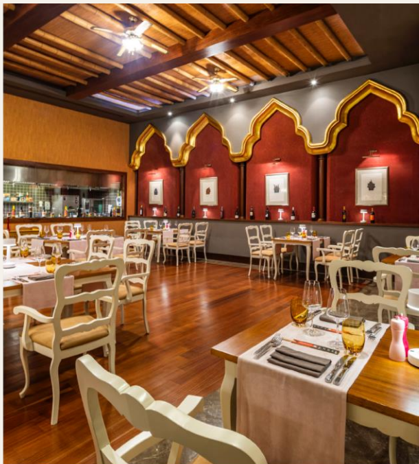
Trader's Spice Asian Restaurant