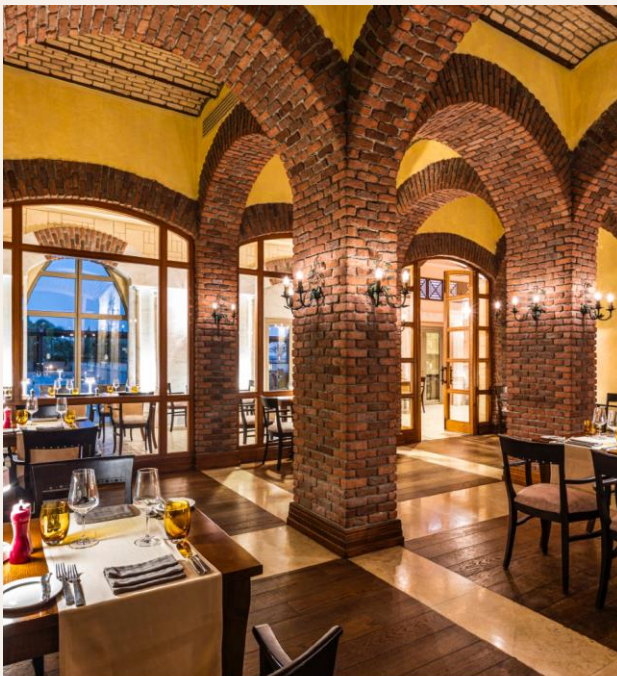
Cilantro Italian Restaurant