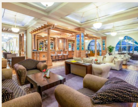
The Dome Cafe