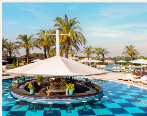
Swim Up Bar